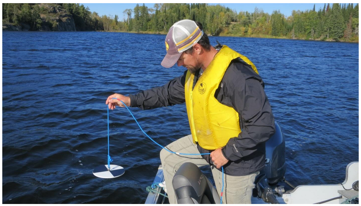
Figure 2 – Lowering of Secchi disk

Lake productivity samples were collected both as a euphotic zone composite and at a depth of 1 m from the bottom. The euphotic zone is the section of the water column where enough light penetrates to facilitate algae growth (measured as 2X the Secchi depth). In order to obtain a water sample containing water from the euphotic zone, a weighted, 500 mL, small neck bottle (Figure 3) was lowered with a rope in the water column to a depth of 2X Secchi depth then quickly brought to the surface before the bottle became completely filled.