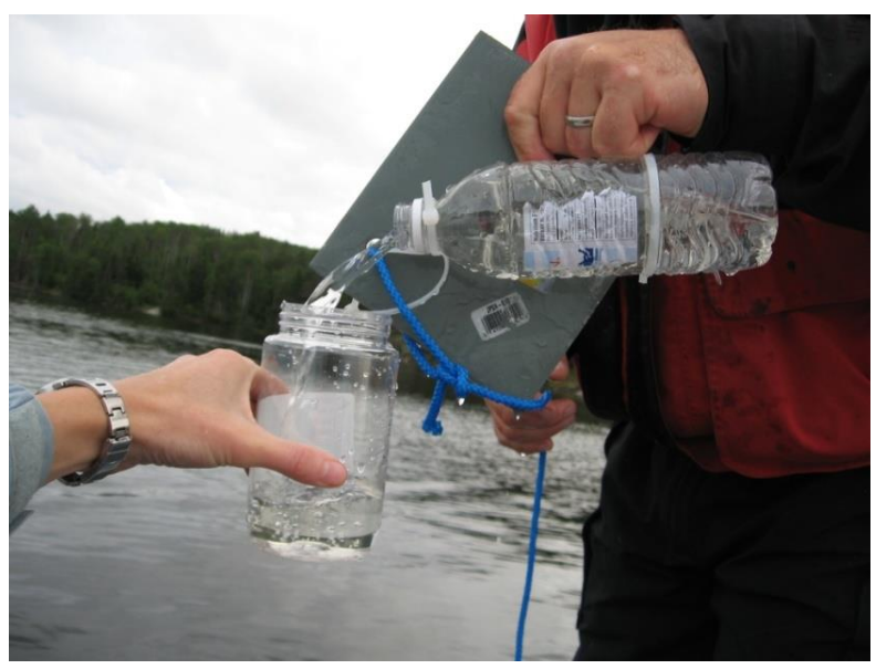
Figure 3 – Transferring water sample from euphotic zone composite into lab sample bottle

Lake productivity samples were collected both as a euphotic zone composite and at a depth of 1 m from the bottom. The euphotic zone is the section of the water column where enough light penetrates to facilitate algae growth (measured as 2X the Secchi depth). In order to obtain a water sample containing water from the euphotic zone, a weighted, 500 mL, small neck bottle (Figure 3) was lowered with a rope in the water column to a depth of 2X Secchi depth then quickly brought to the surface before the bottle became completely filled.