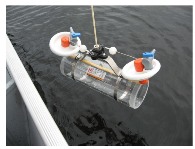
Figure 4 – Horizontal Beta Sampler prior to deployment

At each site, an additional water sample was taken approximately one meter from the bottom of the lake using a Beta horizontal water sampler (Figure 4). Both ends of the water sampler were opened prior to lowering it (using a rope) to the desired water depth. At the desired depth, a small weight was sent down through the water column along the length of the rope triggering a release mechanism on the sampler and causing the sampler caps to close.